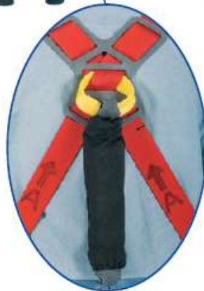
Available with Integral Shock-Absorber