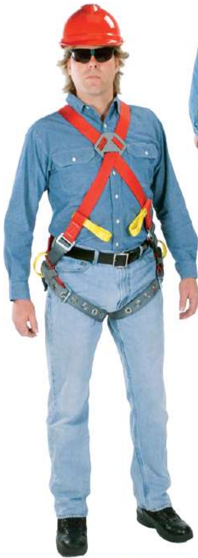
ArcSafe Cross-Chest Harness