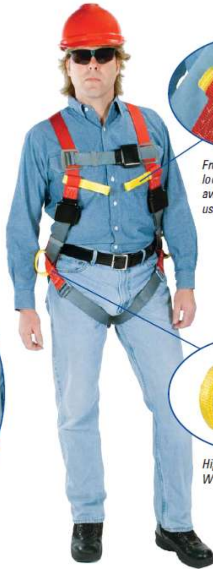
ArcSafe Vest-Style Harness