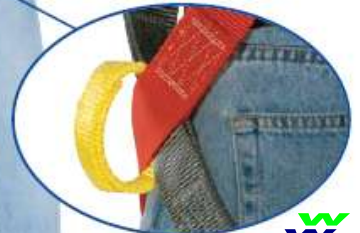
Hip Loops for Work Positioning